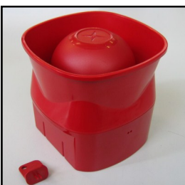
Picture 1 - General overview of the device and its opening key

*** These lifespan values refer to the device being programmed with a control signals transmission period of 12 seconds. If the device is activated for 30 seconds a week for test, the primary battery's lifespan reduces to 4.1 years (with the sounder activated and the volume set at maximum level).