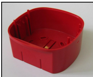
Picture 2 - Wall base