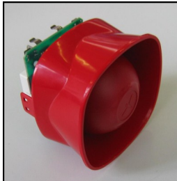
Picture 3 - Sounder device